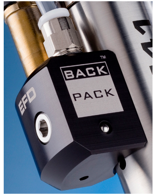
The BackPack actuator is a compact, fast-acting solenoid.