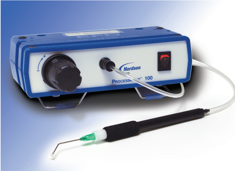
Prevents damage to intricate components using a lightweight pickup pen.

Provides a simple, efficient way to lift and position small or delicate components