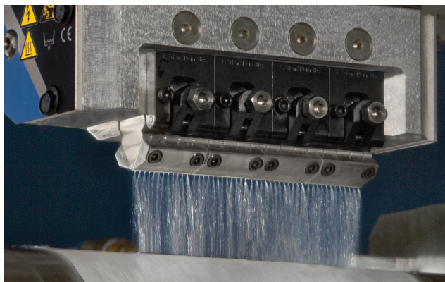
A greater nozzle-to-substrate distance decreases exposure to airborne contaminants that can compromise performance.