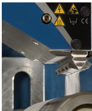
Patented porting of process air, (both parallel and angled) to the adhesive output produces random, continuous filaments with excellent cutoff.