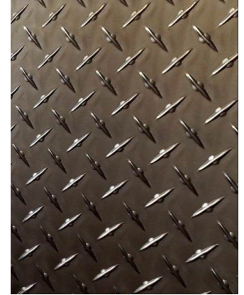
Processing of flat rolled products into various sheet dimensions, such as diamond plate

would slip when making contact with the product due to the oil used on the cold-rolled steel. This oil residue would remain on the rotating wheel of the mechanical encoder, causing additional measurement inaccuracies when processing other products. The length measurement errors directly affected the cut-to-length accuracy. Measurement inaccuracies were greater than 1% and resulted in material scrap and quality issues.