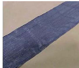
LASD Dispensed with MSA

© 2019 Nordson Corporation | All Rights Reserved | AUL-19-6075 | Revised 5/19