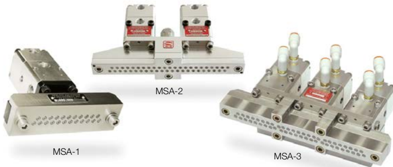
Multi Stream Applicator Series