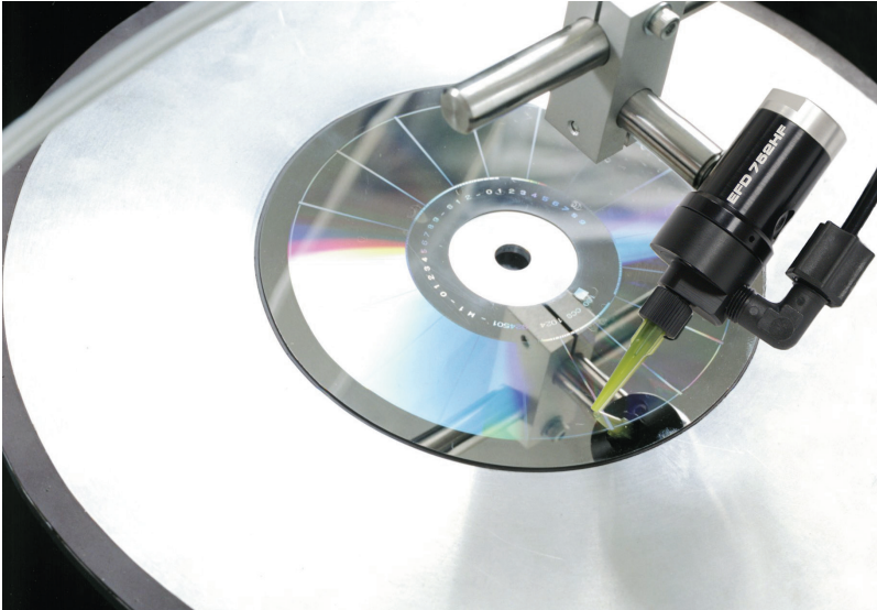
752HF used in manufacturing of Blu-Ray DVDs and other media.

Controlled, bubble-free dispensing for bonding and lacquer coating