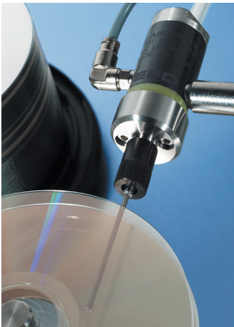
752HF bonding DVDs with UV-cure resins.

"We never expected these valves would work this great and be this reliable! Over 50 million cycles without maintenance!"