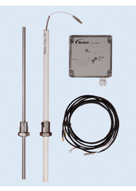
Level detection kit for non-conductive containers (e.g. plastic) contains additional counter electrode

For more information, speak with your Nordson representative or contact your Nordson regional office.