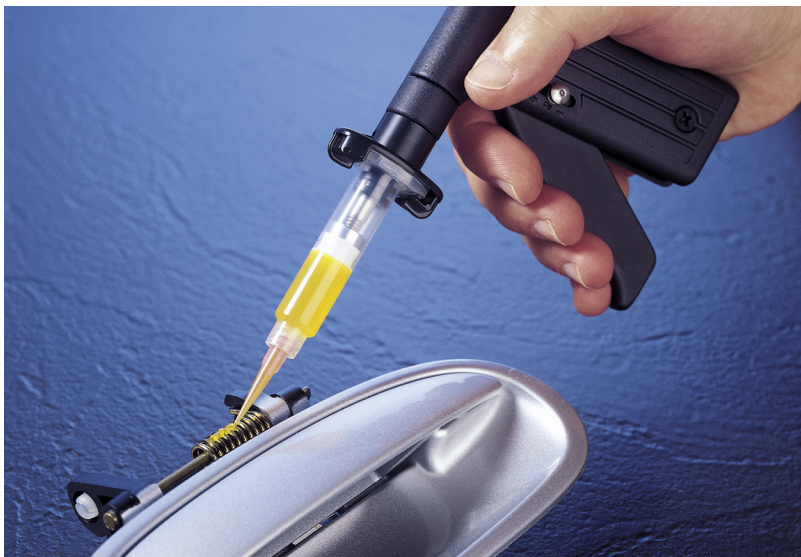
DispensGun simplifies the application of medium to high viscosity fluids.

Simplifies the application of medium- to high-viscosity fluids