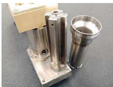
ControlFlow system with grooved riser and sleeve

Overview. ControlFlow solder nozzles are specially designed with controlled flow risers and sleeves that significantly reduces the formation of solder dross and minimizes the creation of solder balls.