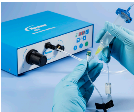
Dispensing a low-viscosity solvent on medical devices.