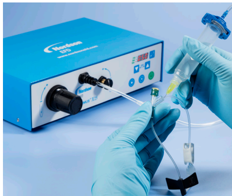
Dispensing a low-viscosity solvent on medical devices.

Nordson EFD's Performus™ X dispensers increase throughput, improve yields, and reduce production costs through controlled application of adhesives, lubricants, and other assembly fluids.