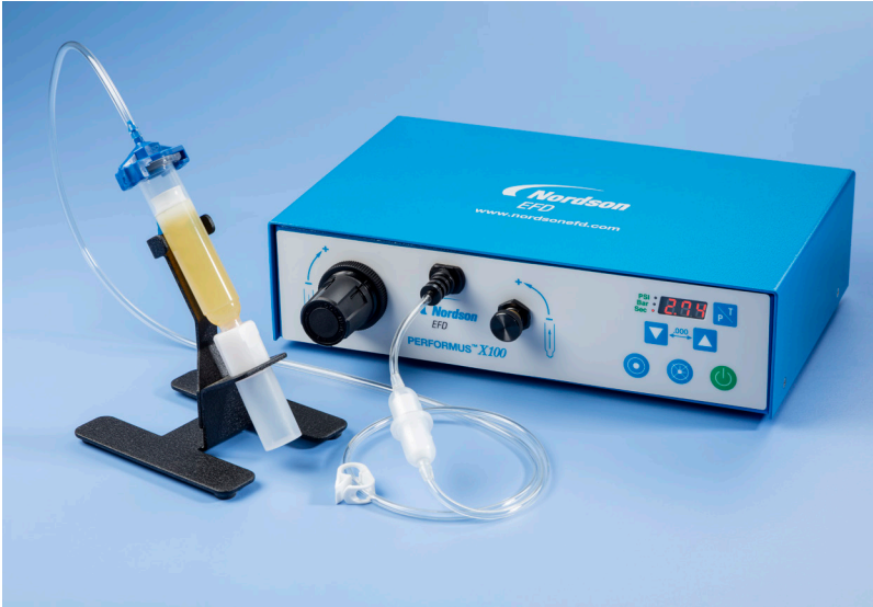
Performus X dispensers provide reliable dispensing for general applications in a wide range of industries.

Reliable benchtop fluid dispensing control for general applications