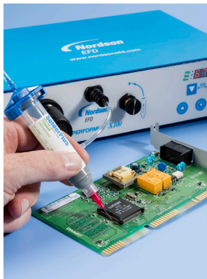
Dispensing SolderPlus® solder paste on PCB boards.