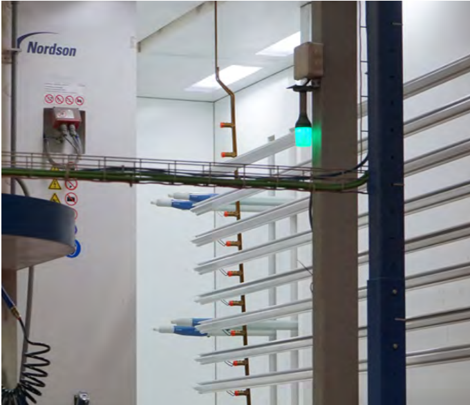
Color changes are indicated by a light

“For normal applications, one coating pass is sufficient,” explains Juan Pedro Giménez. “But we also offer products that are exposed to the rough sea air in Marine Sea Quality. We coat them twice so that we end up with a particularly corrosion-resistant film thickness of 160 \mu .”