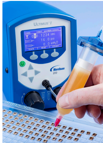
Dispensing flux onto electronic components.

Featuring simultaneous digital display of all dispenser settings and time adjustment as fine as 0.0001 seconds, Ultimus™ I-II dispensers bring exceptional process control to medical device, electronics, and other critical dispensing processes.