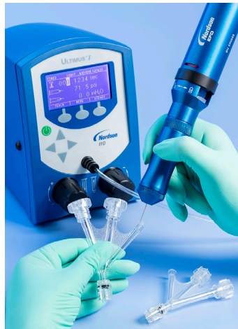
Dispensing adhesive onto medical components with HPX™ tool.

Ultimus dispensers bring exceptional process control to medical device, electronics, and other critical dispensing processes.