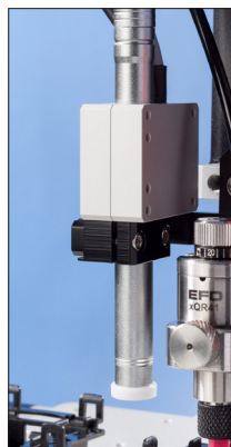
Pencil camera verifies product presence.

Nordson EFD's EV Series automated systems include simple vision for precise fluid dispensing using EFD syringe barrel and valve systems.