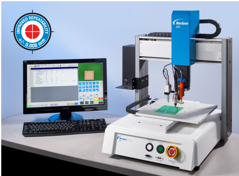
EV Series pencil camera vision makes programming patterns easier.

Easy automation for precise fluid application with simple vision pencil camera