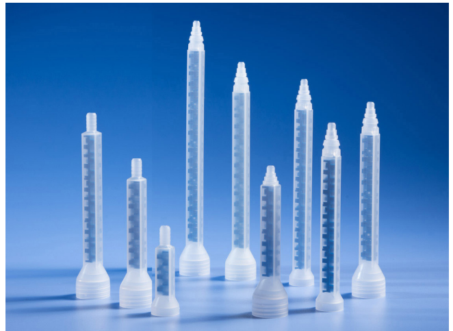
The Nordson EFD Series 480 OptiMixer provides better mix quality in a shorter length.