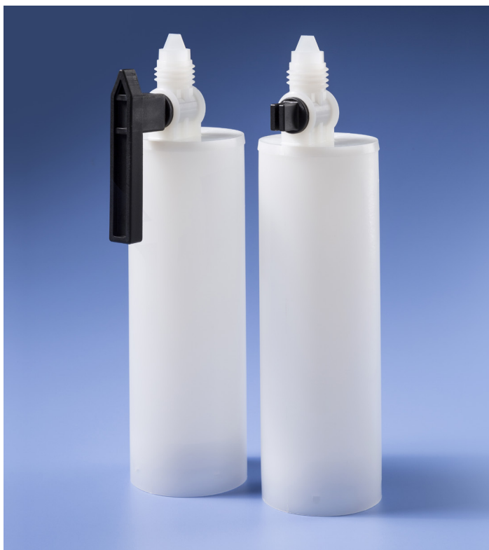
Robust neck outlet prevents cracking.

The 380mL coaxial cartridge has a center tube that contains one material and an outer “doughnut” that contains a second material in a 10:1 ratio. The cartridge comes assembled with a valve that rotates to open and close, eliminating the need for a plug closure and retaining nut.