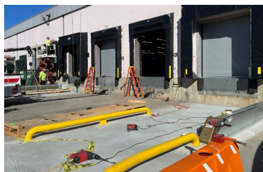
PHOTO: Loading dock at our EFD division's Norwich, Connecticut, U.S., facility

In 2024, our EFD division's Norwich, Connecticut, facility implemented several operational efficiency projects. The team completed an energy audit, installed new air compressors to increase energy efficiency and replaced 11 energy-intensive hydraulic presses with nine energy-efficient models, which enhances production capabilities and reduces energy consumption. The loading dock was also a priority area for safety and operational improvements, including the installation of insulated dock doors with enhanced weather sealing. Several waste reduction initiatives, such as packaging reductions, process improvements to eliminate wasted “runners” and increasing utilization of regrind, were also implemented. Looking ahead, a project to replace 325 high bay lights with LEDs has been approved, with installation expected in late 2024 or 2025.