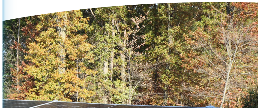
PHOTO: Solar panels at Nordson's Westlake, Ohio, U.S. headquarters

In 2023, we doubled our purchasing of renewable energy certificates compared to 2022, and we entered into additional renewable energy purchase agreements in 2024 that will be reflected in next year's energy/emissions data. We also continue to explore collective purchasing, project investment and other opportunities for region- and project-specific renewable energy in energy grids where we maintain significant operations.