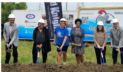
PHOTO: Good Knights facility groundbreaking

Through an employee-organized fundraiser and the Nordson Matching Gifts initiative, Nordson contributed approximately $180,000 to Good Knights of Lorain County, a nonprofit that provides high-quality beds, along with pillows and other bedding, to children, seniors and veterans in need. The donation is helping to fund a new facility for the Good Knights organization that broke ground in September 2024.