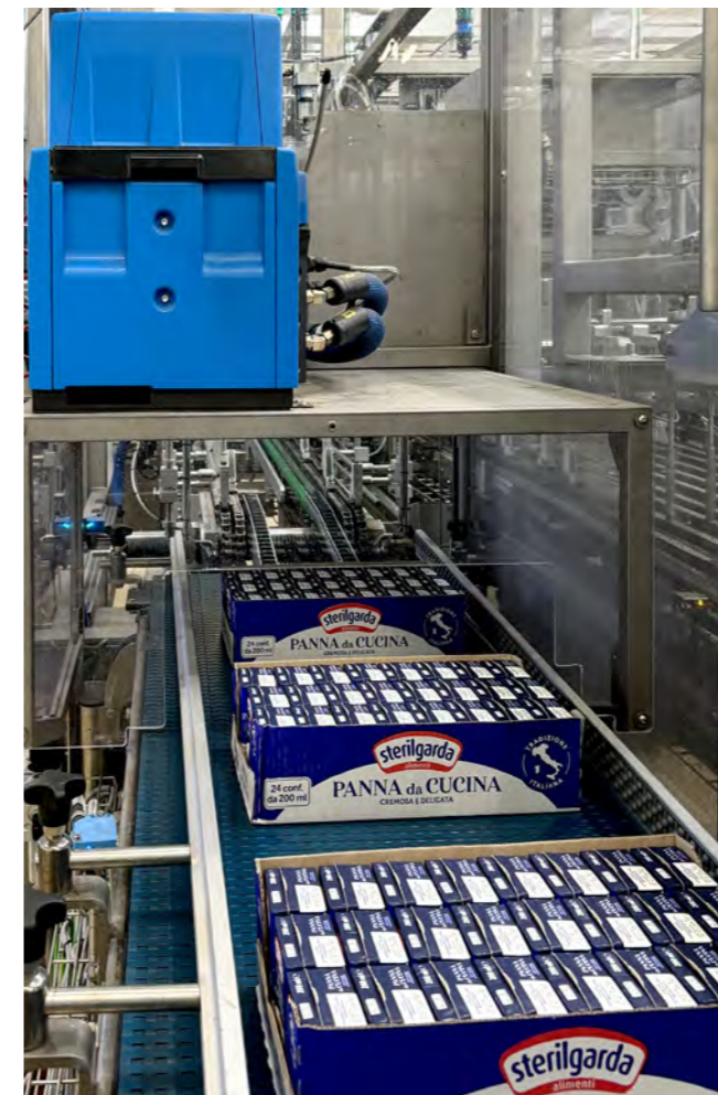
The new systems minimize downtime by reducing nozzle clogging and the frequency of part replacements, leading to lower maintenance costs and higher overall efficiency.

Sterilgarda's strategic collaboration with OEM Mariani Srl plays a crucial role in this process. This partnership ensures the seamless integration of the new packaging systems into Sterilgarda's existing infrastructure. The result is a significant enhancement in the company's packaging capabilities, enabling it to handle a wide range of packaging applications, from sealing trays to wrap-around trays.