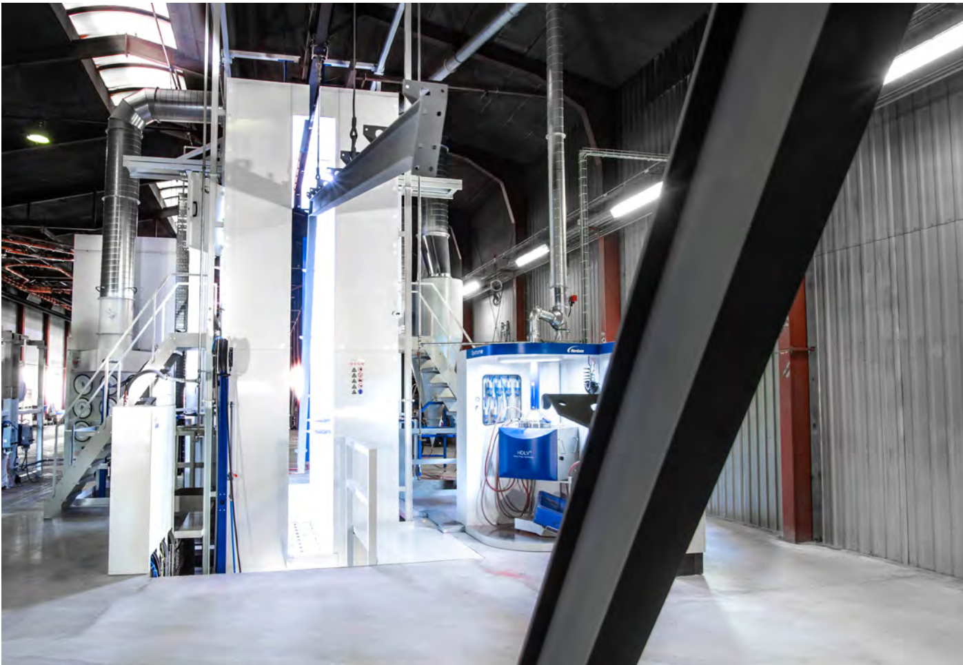
The product sections of different heights are coated at different conveyor speed to maximize the overall production rate.

Since the start of the operation in April 2019, the new system performance has exceeded the Grædstrup Stal expectations. “The gains in our productivity are most impressive,” confirms Allan Kåstrup Kristensen, “What used to take us 20 hours is now powder coated in a single, 8-hour shift. Just imagine the energy savings from not having to heat our huge oven for 3 shifts.” The average line speed increased from 1 to 3.5 m/min. Additionally, color changes are now finished in 15 minutes.