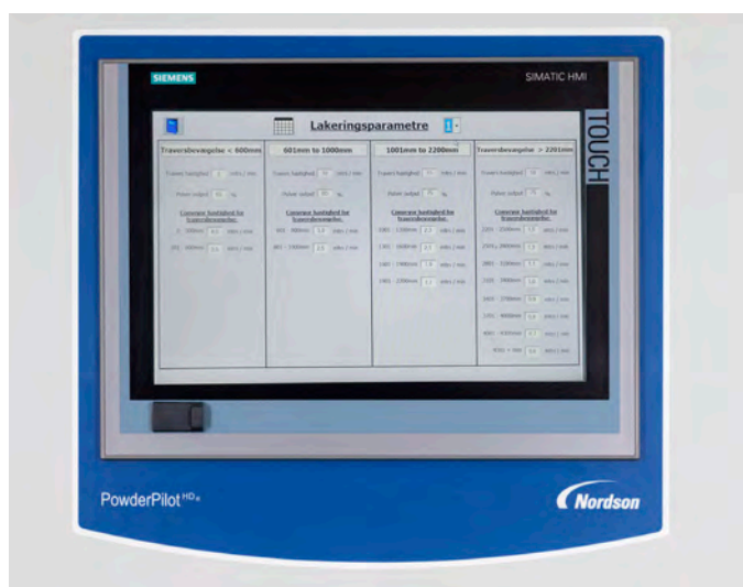
The PowderPilot HD controller optimizes the coating parameters for products of various heights processed at different conveyor speed.

“The Nordson system allows us to fine-tune and program many operating parameters making it easy for us to gain a deeper understanding of the powder coating process,” Allan Kåstrup Kristensen continues, “We are closely monitoring the coating and are experimenting with programs to further optimize our operation and reduce costs. This investment has already paid for itself. All goals achieved.”