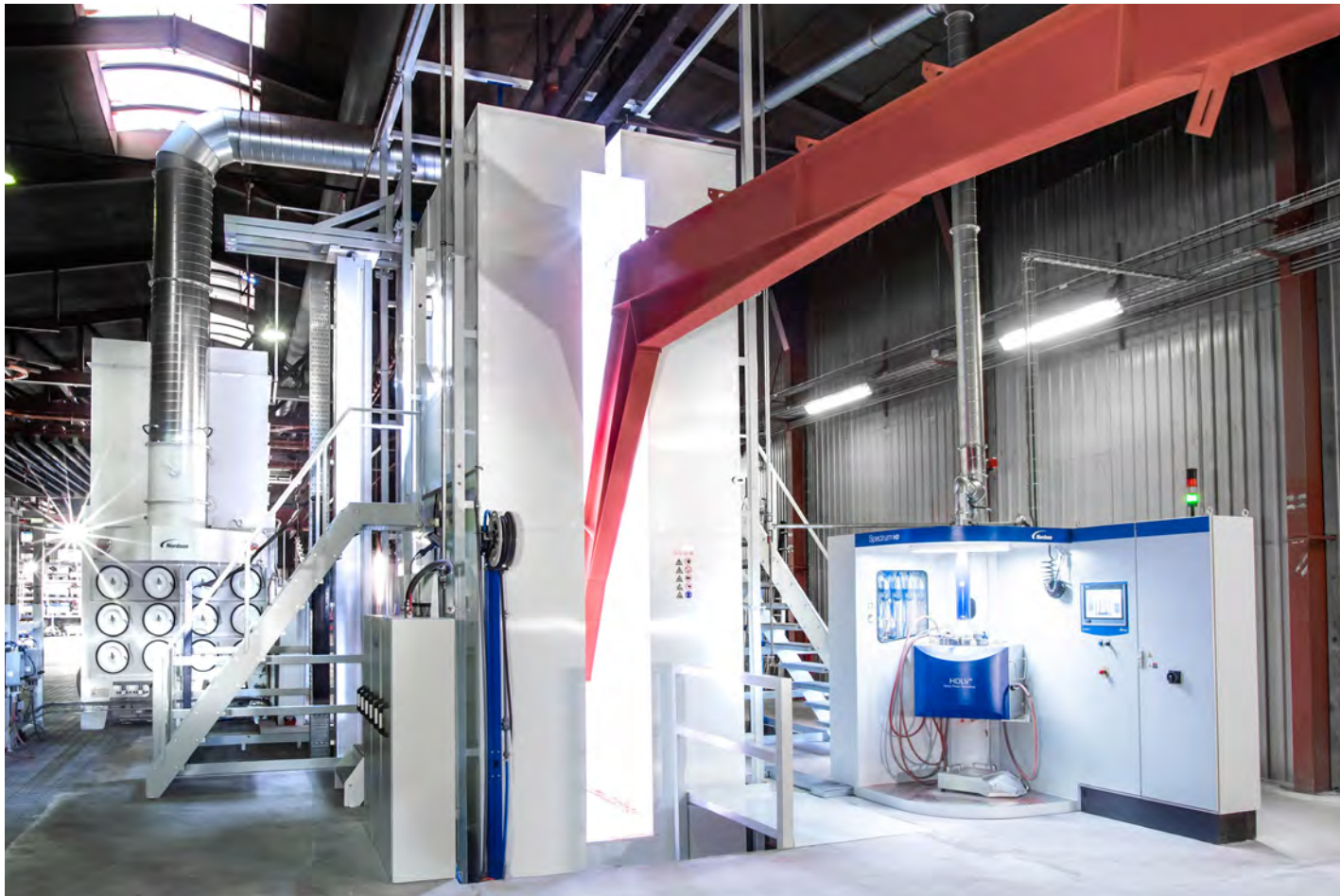
7.2 m tall booth with the Spectrum® HD powder feed center is color changed in 15 minutes.

Unique powder coating system doubles the productivity, reduces the color change time, and saves powder. All on an extra-large scale.