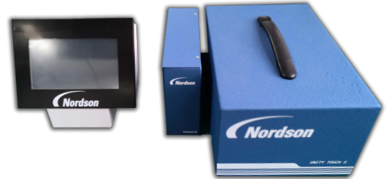
Unity Touch S Controller

Nordson's Unity control systems are available in two versions designed to meet differing customer needs—the Unity C controller and the Unity Touch S controller. Both systems are a compact size, compatible with both Unity IC and PURJet™ applicators, and easy to integrate with a parent machine for full process control. This updated, affordable technology is easier for operators to use for optimal process efficiency.