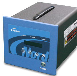
Unity C Controller

Multifunction controllers provide easy system integration and precise adhesive dispensing