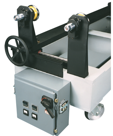
Fixed Height Ultracart™ with Preheat Station for Single Manifold Dies