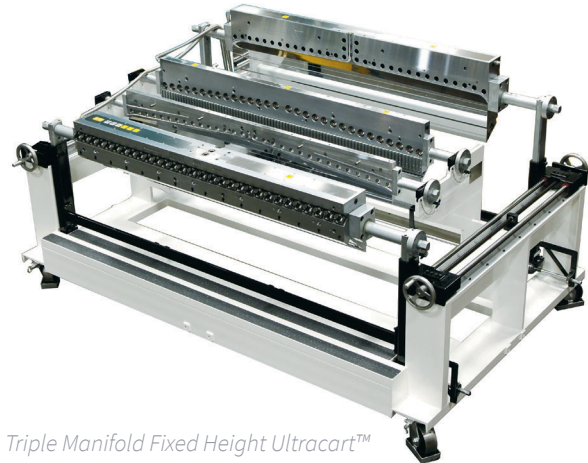
Triple Manifold Fixed Height Ultracart™