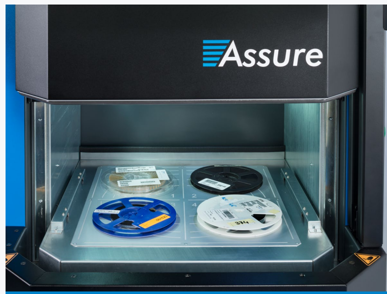
Fully automatic counting needs 10 seconds for every kind of bundle. Nordson Dage

Topics such as annual or interim inventory are no longer a time-consuming counting marathon subject to human error: “Thanks to the data integration into our systems, it has become a routine task.” At two locations, the component counting system has now been integrated into automatic storage systems. As a result, the staff is no longer occupied with simple tasks, she assures: “We can use them for higher-value activities and thus compensate somewhat for the lack of skilled workers”. Meanwhile nine machines have been installed in the Zollner group of companies at eight locations in the warehouse and production area. In Altenmarkt and USA with connection to an automatic storage system, in Furth, Untergschwandt, Zandt, Romania and Hungary as a single system.