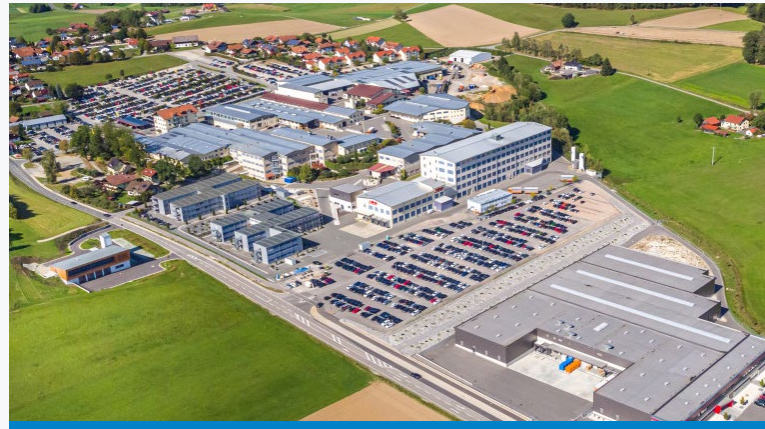
Zollner Headquarter in Zandt. Zollner

Virtually everything that contains electronics is developed and manufactured: payment terminals, check-in terminals, ticket machines, parcel stations and car headlights. And also elevator controls, medical components in magnetic resonance tomographs or currently also drives for electric cars.