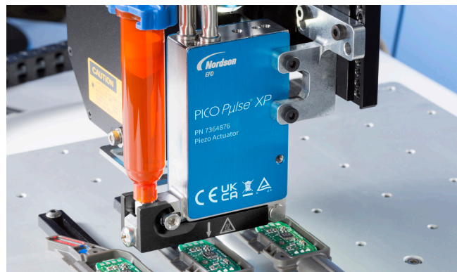
PICO Pulse XP's sustained stroke target seeking maintains long-term dispensing repeatability.