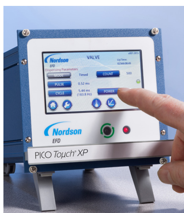
PICO Touch XP provides more adjustable parameters to fine-tune dispensing performance.