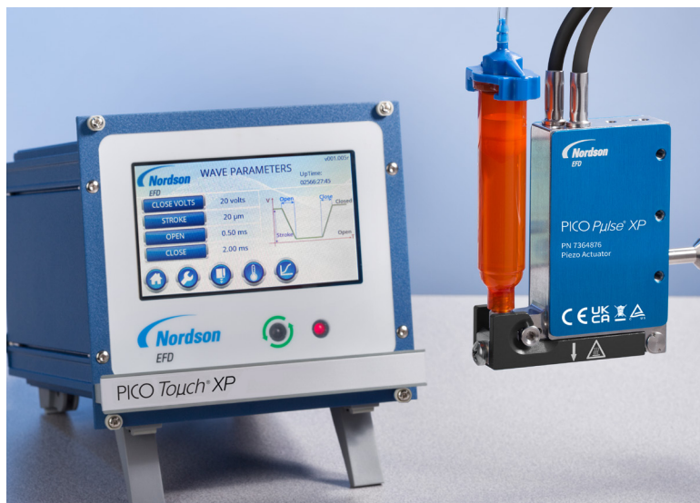
PICO XP jetting systems provide extreme precision and repeatability at up to 1000Hz continuous.

Extremely Precise (XP), Repeatable Micro-Dispensing