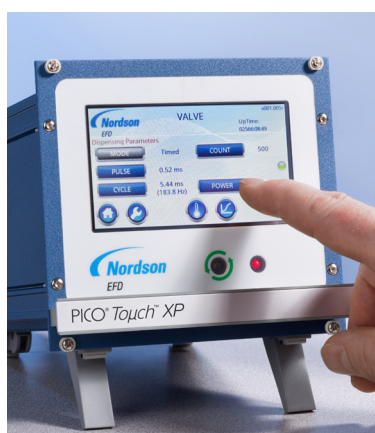
PICO Touch XP provides more adjustable parameters to fine-tune dispensing performance.