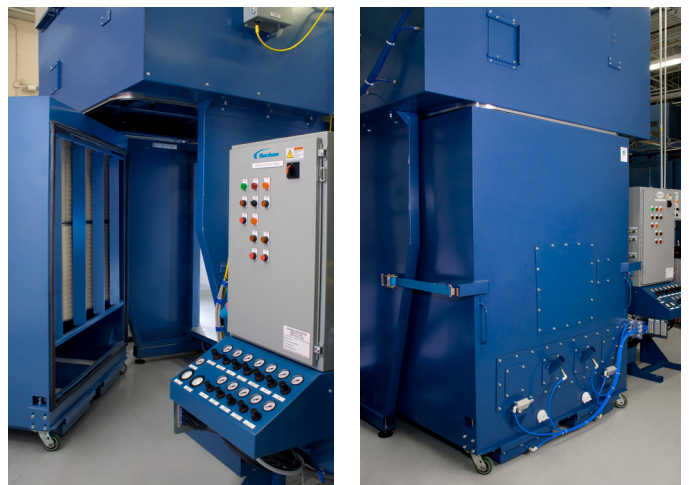
The compact and flexible color module design allows for a space saving footprint and easy to configure powder delivery options.

The compact and flexible color module design allows for a space saving, more compact footprint and easy to configure powder delivery options.