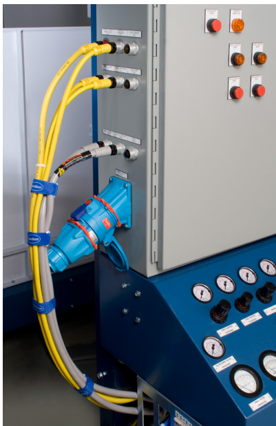
The Excel 3000 Powder Spray Booth features plug-and-spray technology that allows for fast and easy installation of all electrical components.

The Excel 3000 Powder Spray Booth features plug-and-spray technology that allows for fast and easy installation of all electrical connections. The durable and flexible molded cable and plug design means that there are no wires to terminate and no electrical connections to troubleshoot. All electrical devices come pre-wired for fast and easy connection – which means the Excel 3000 Powder Spray Booth is ready to spray – quickly and easily.