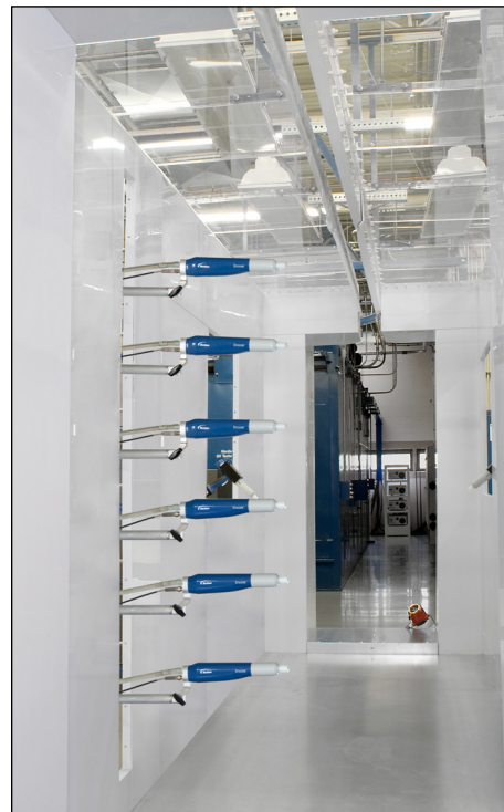
PolyPlus™ wall panels provide enhanced light within the spray booth and low attraction of powder to the booth wall surface, allowing for fast, easy, and quick color change.

The durable yet functional canopy design features a clear copolymer roof for ample light during powder spray application and comes standard with PolyPlus wall panels. The PolyPlus wall panels provide enhanced light within the spray booth and low attraction of powder to the booth wall surface, allowing for fast, easy, and quick color changes. Each canopy material features a standard 2 ft. vestibule on both the exit and entrance end part openings for ample containment of powder within the booth.