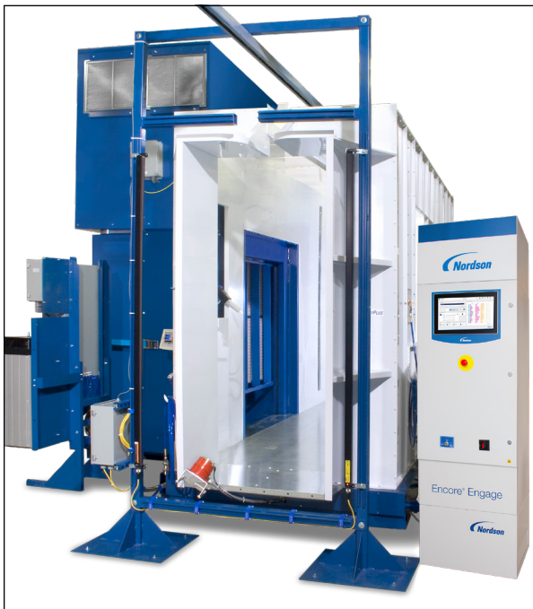
The modular design of the shorter more compact booth base allows for flexible location of both automatic and manual gun stations.

With plug-and-spray technology, low profile modular booth base, and PolyPlus™ canopy material, this innovative design provides large system features and benefits in a compact package that is easy to install, easy to operate, and easy to color change. The Excel 3000 Powder Spray Booth is available in 10,800 CFM and 15,500 CFM versions – in various modular and flexible system configurations.