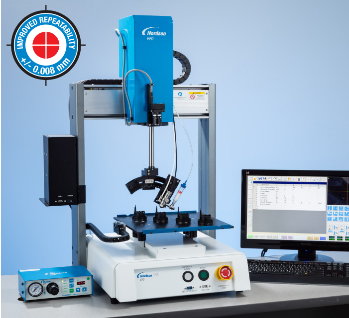
RV Series makes 4-axis dispensing automation more intuitive with proprietary DispenseMotion software.

Easy 4-axis automation for precise fluid application with smart vision