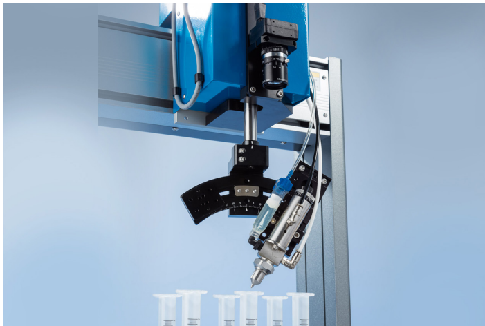
Smart vision CCD camera verifies workpiece presence and orientation.

Nordson EFD's RV Series 4-axis automated systems are configured for precise fluid dispensing using EFD syringe barrel and valve systems.