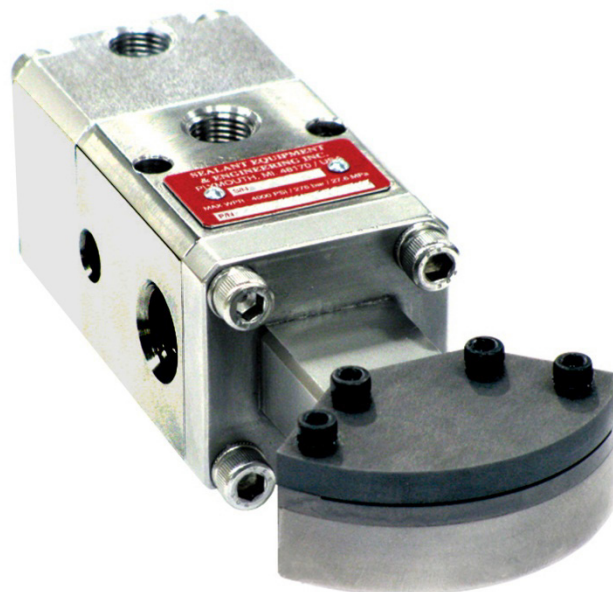
2200-245 Series Wedge Applicator

Models are available with a variety of O-rings and seals. Stainless steel versions and specialty versions are also available.